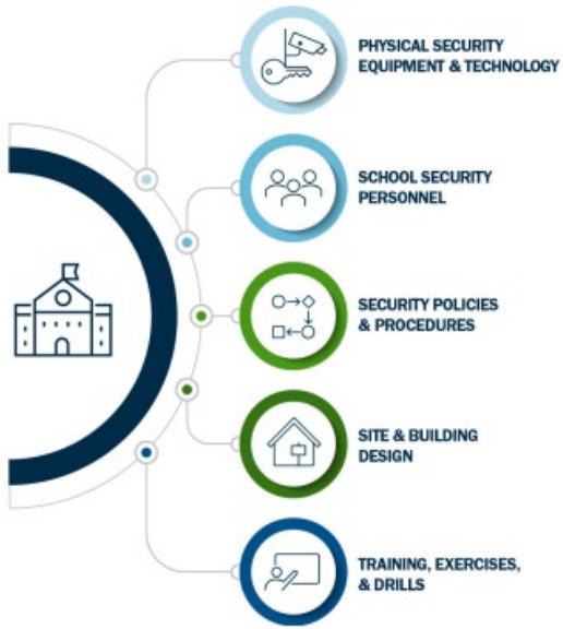
OF MONTCLAIR BOARD OF EMERGENCY MANAGEMENT QUICK REFERENCE GUIDE